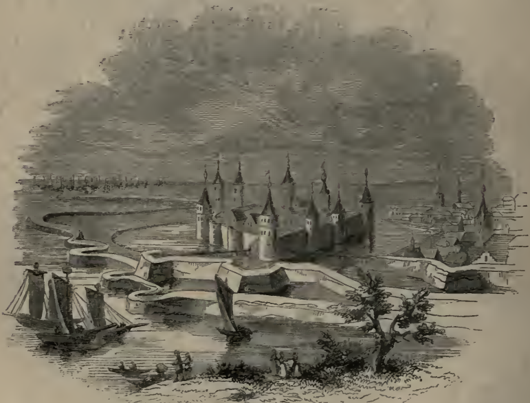
GENERAL VIEW OF SLUYS.—From an old plan, in Flandria Illustrata , by Ant. Sanderus.

THE king of France, to show his impatience for the invasion and his dislike of being at too great a distance, came to Sluys. The report was now daily current in Flanders and Artois, "The king will embark Saturday, Tuesday, or Thursday." Every day of the week they said, "He will embark to-morrow, or the day after." The duke of Touraine*, the king's brother, the bishop of Beauvais, chancellor, and other great lords, had taken leave of the king at Lille, and returned to Paris. I believe, indeed it was assured me for fact, that the duke was appointed regent during the king's absence, in conjunction with the count de Blois and other principal barons, who had not been ordered on the invasion. The duke of Berry was still behind, though he was advancing slowly, for he had no great desire to go to England. The king of France and duke of Burgundy were much vexed at his delay, and wished his arrival: however, the embarkation of stores continued at a vast expense to the great lords; for what was worth only one franc they were made to pay four; and those who were hoping speedily to cross over valued not their money in making preparations, but seemed desirous to rival each other in expense.